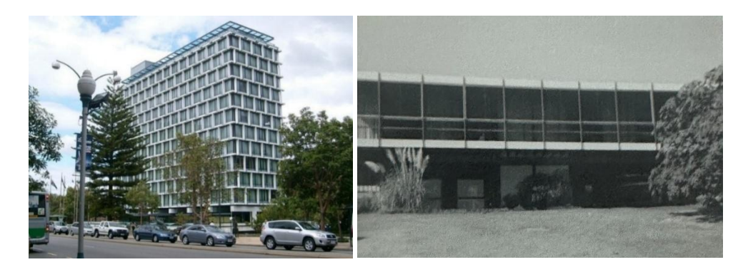
1963 Council House Perth (Wikipedia); 1964 Waller Residence at 282 West Coast Highway Scarborough shown in 1971 (Julie & Sam Ruiz)

One of the most distinctive elements of the building is the pattern of T-shaped sunshades placed uniformly against the four glazed walls of the building. According to Lindsay Waller there was only one possible dimension that would allow the Ts to go around the corner and repeat themselves. This dimension was arrived at empirically and was set out by Waller after numerous geometric experiments. The result is an apparently floating cage of Ts creating a continuous mat of a sunscreen which folds seamlessly around the corners of the building.